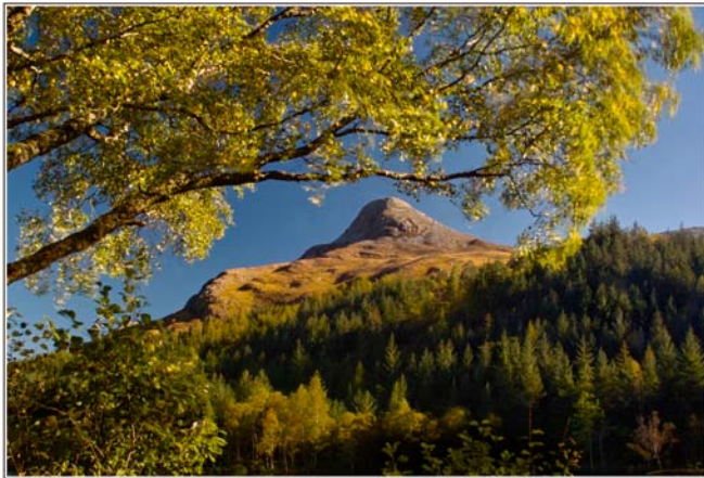
An A4 print Window mounted on an A3 mount in landscape orientation.

window mount. (A sheet of mount board with the relevant aperture cut out)